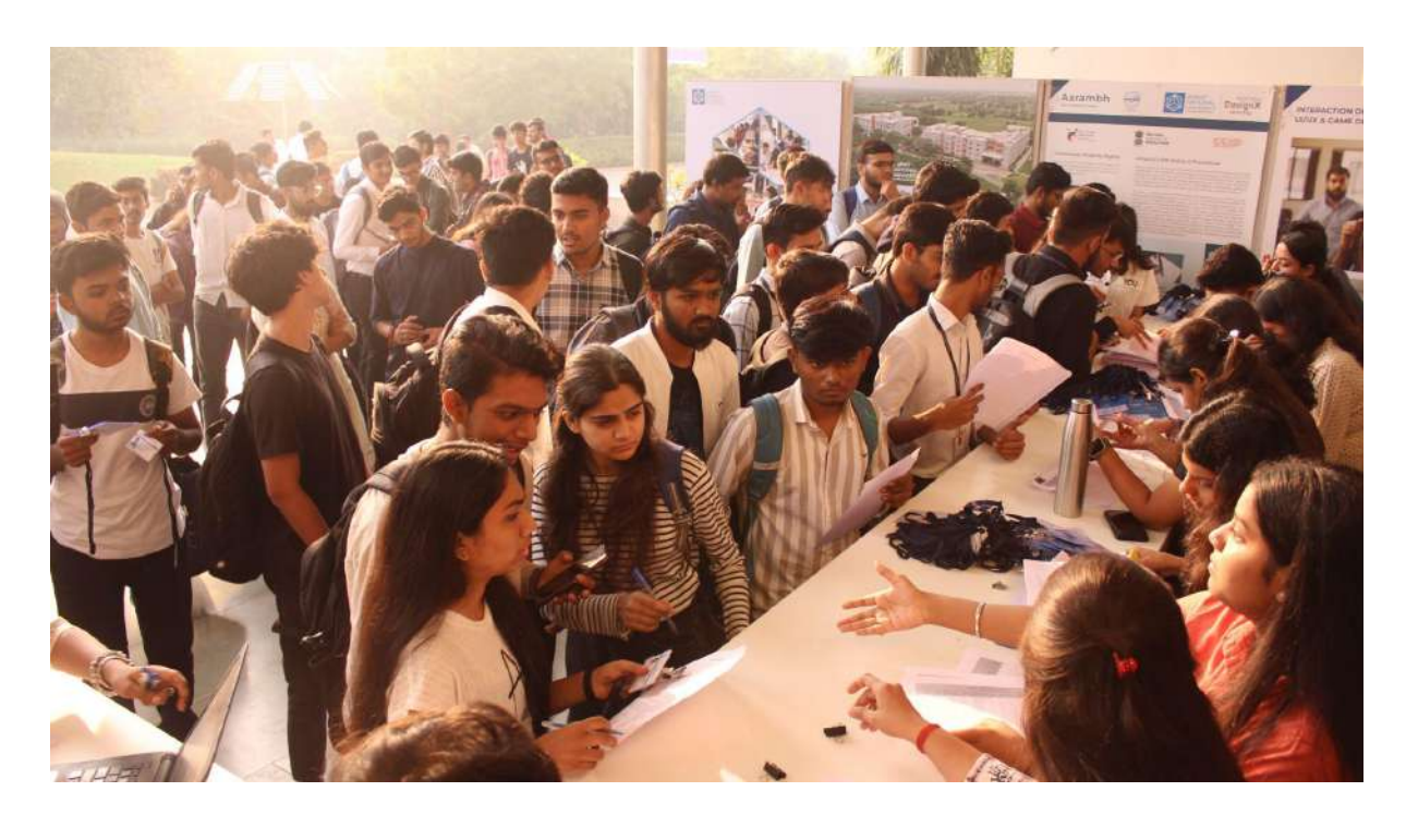
Images 1 & 2: Team registration at 7:30 am at the reception of Anant National University, Ahmedabad